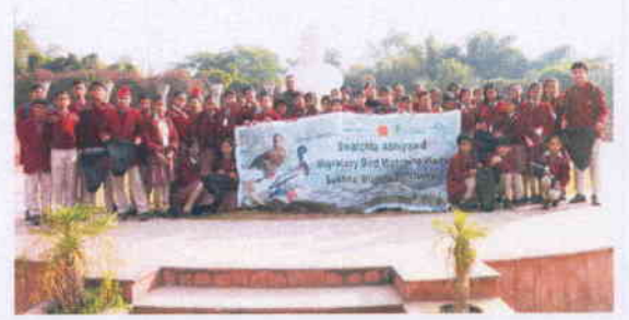
Class VI learnt about Wetlands and Migratory Birds during an educational trip to the Regulatory End of Sukhna Lake in association with Dept. of Forest and Wildlife, Chd Admin. and NGO Yuvsatta on 10th December 2019