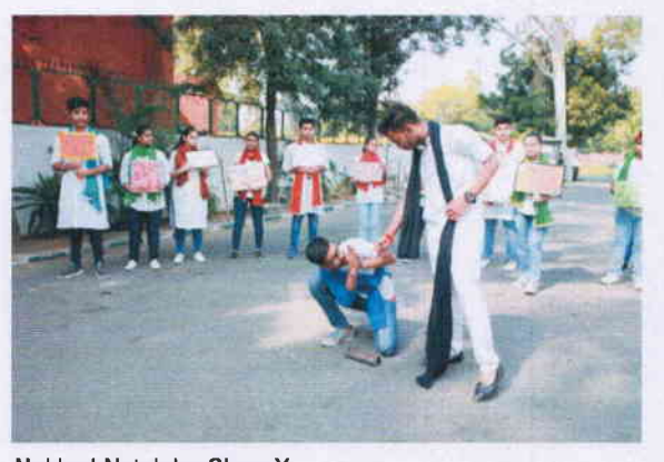
Nukkad Natak by Class X