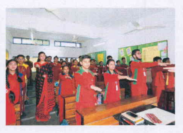
During Vigilance Awareness Week, KB DAV-7, Chandigarh takes an Integrity Pledge against corruption. Students took the pledge to create awareness against corruption and learnt about the Code of Ehics. A role-play "Jaag Utha Insaan" was presented by the students of Class X