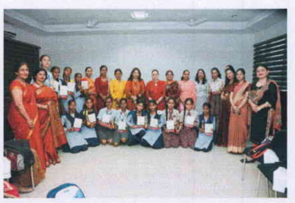
Winners of Poster Making Competition