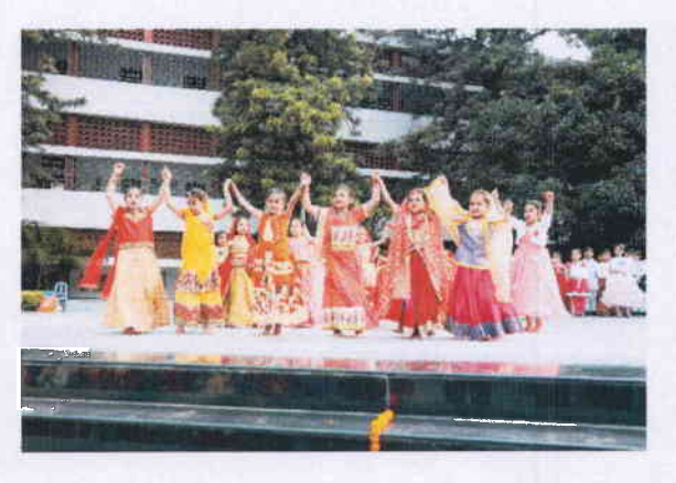
Class II of Junior School joyously express their gaiety on 25th October 2019 as the School celebrated Diwali