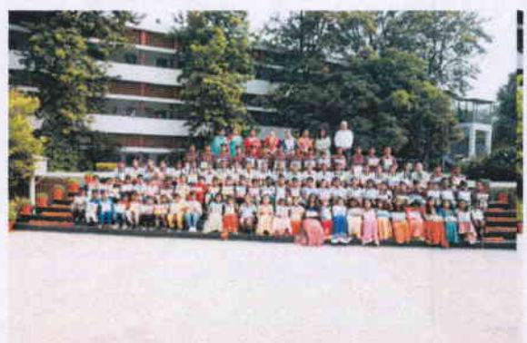
The Champions of Life-Saral Ahsaas celebrates Diwali with their extended Family on Campus on 25th October 2019