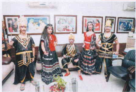
Class VII-VI enacted the scene of Lord Rama's return to Ayodhya and the celebrations consequent to his return on 25th October 2019