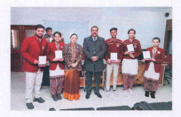
The Bhangra Team put up a wonderful Dance Performance at the Alumni Meet 2019 on 29th December 2019