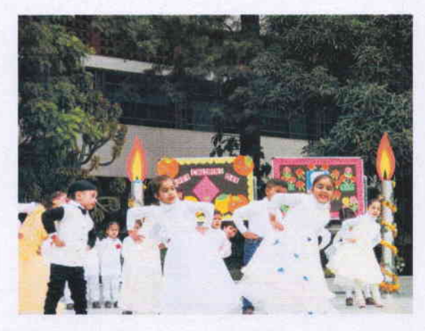
Class Nursery put up a special Assembly to celebrate Children's Day on 14th November 2019