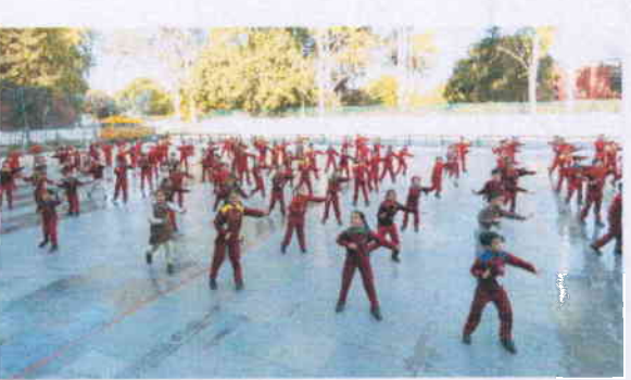
Students practise the steps of Zumba during the Fit India Week celebrations as per CBSE Guidelines