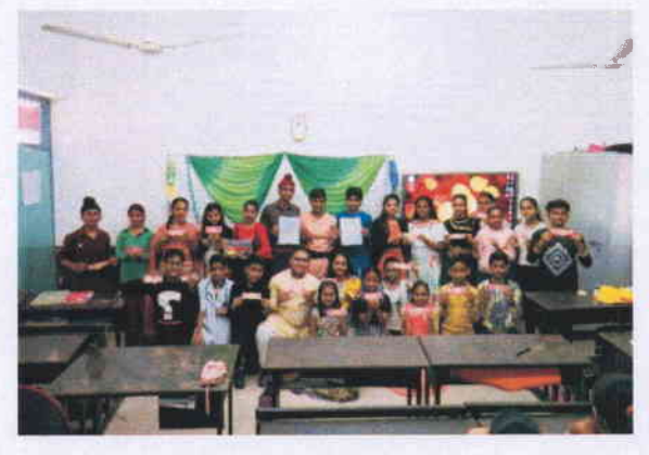
Elocution is important! Class VII makes learning playful as they perform a role-play on 9th November 2019 on Friendship