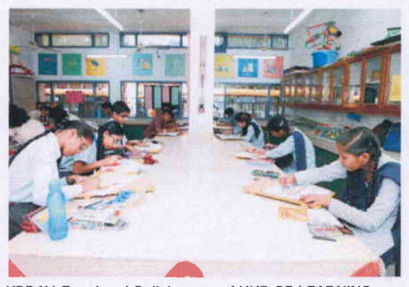
KBDAV-7 as Lead Collaborator of HUB OF LEARNING, on 24th October 2019, conducted a spate of activities