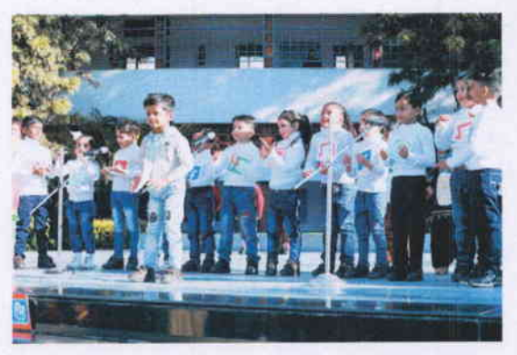
An Assembly was conducted by Kindergarten on 6th December 2019 on the burning issue pertaining to the prolific use of Mobile phones. They urged the audience to be wary of the ill-effects