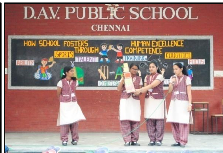
Students Demonstrate the Working of the 'Incredible Invitation' and explain the Innovative Idea