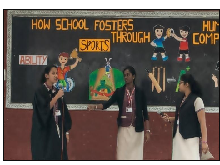
Students enact a Court Room Scene to portray Competence in Life