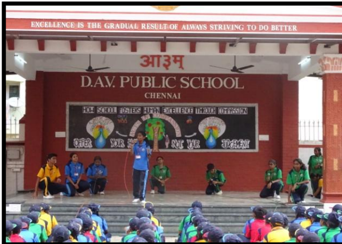
Students enacting their roles in the play – 'Compassionate Souls'