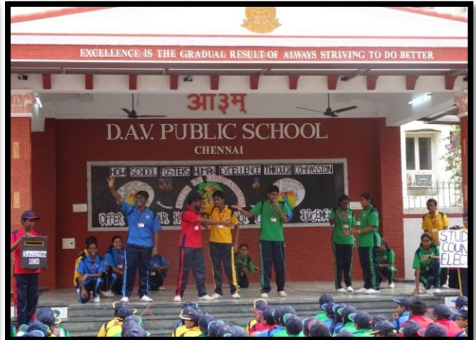
Acts of Compassion