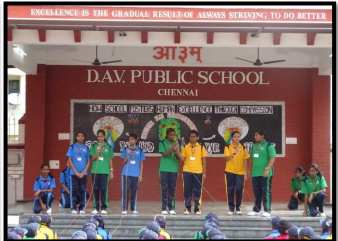
Bringing the Essence of Compassion through Song