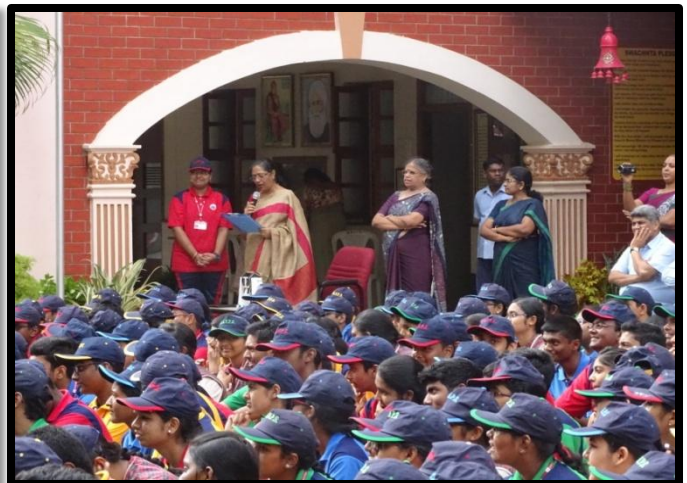
Principal Ma'am giving Feedback about the Assembly