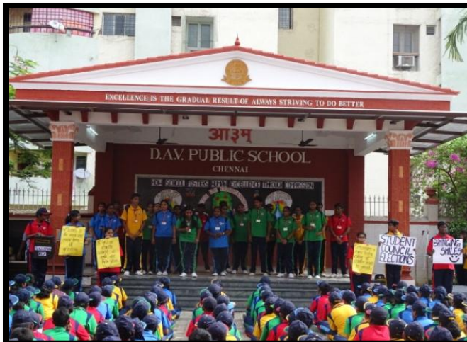
Compassionate Souls of XI – A, delivering the final message