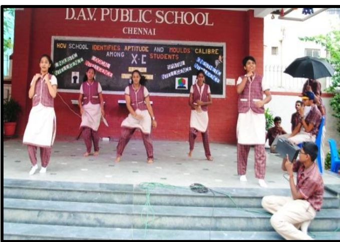
Dancing to the Rhythmic Beat