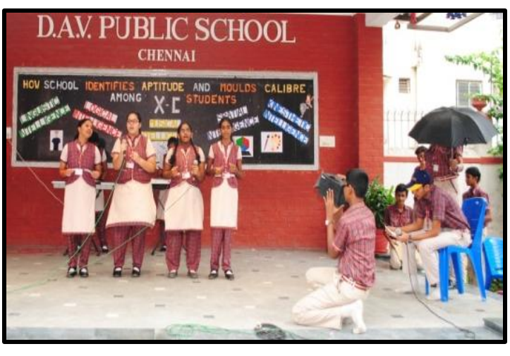
Musical Treat by the 'Nightingales'