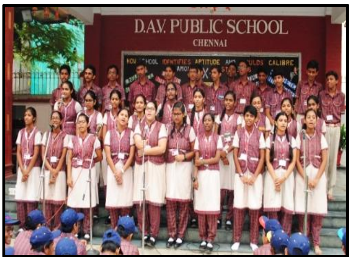
A Self Composed Post Credit Song