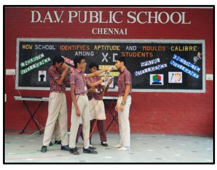
'START – CAMERA – ACTION' – Talent Display of Students

TOPIC: HOW SCHOOL IDENTIFIES THE APTITUDE AND MOULDS CALIBRE AMONG STUDENTS - 5 WAYS