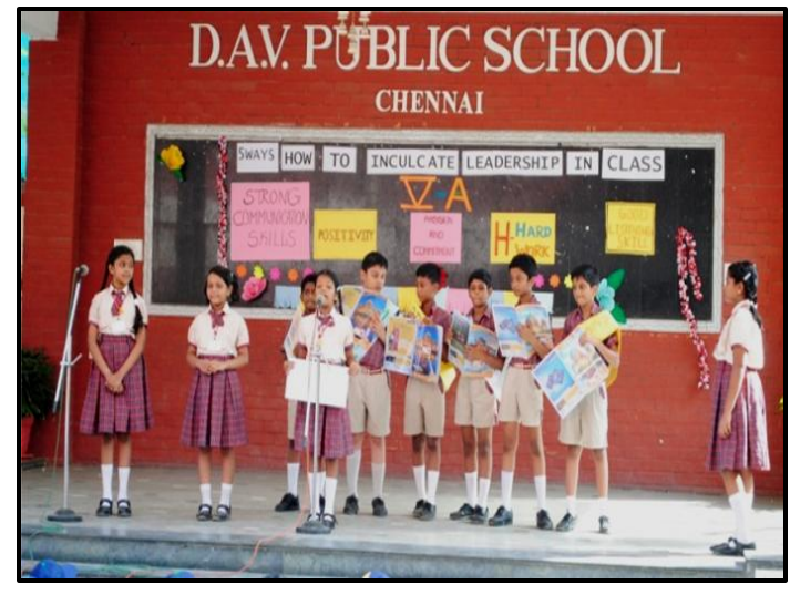
Presenting 5 ways to inculcate leadership with full confidence