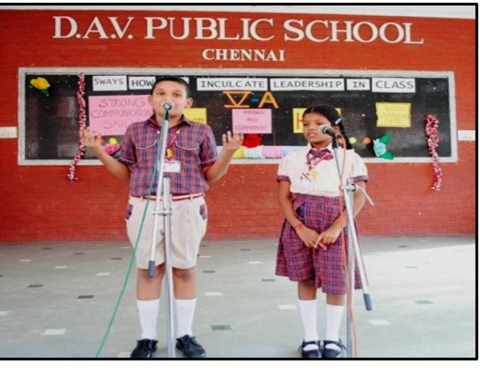
Expressive Introduction of the theme Multi Linguistically