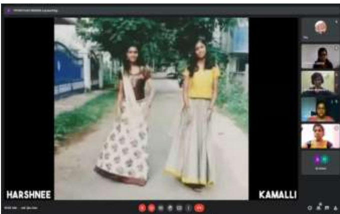
DANZA – Dance by Kinaesthetically Intelligent Students