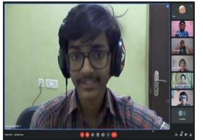
TIYUSAISHI - DEBATE on “Competition enhances Competence”