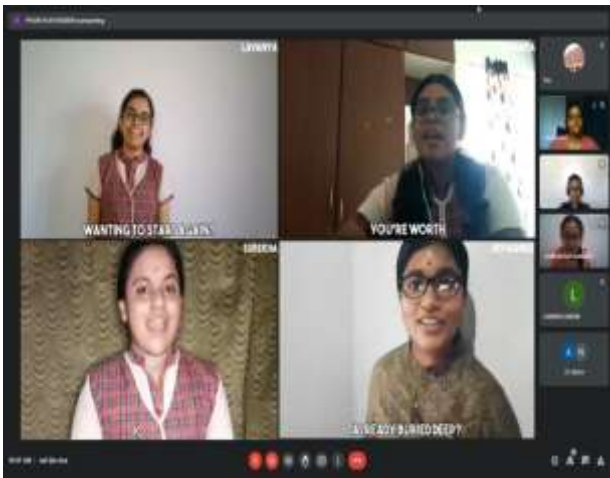
ENCHANTANT – Showcasing Musical Intelligence