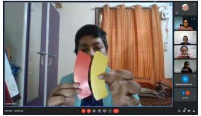
ZAUBERSHOW – MAGIC SHOW