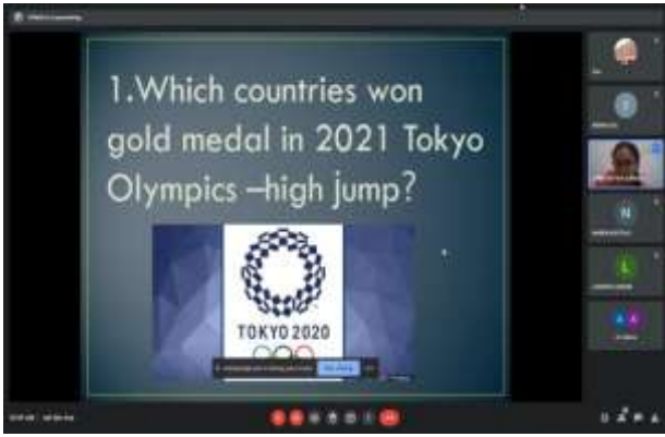
KWIJEU – QUIZ SHOW