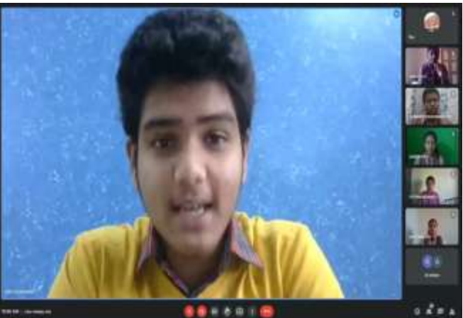
ROLE PLAY - Inculcating Moral Values among the Students