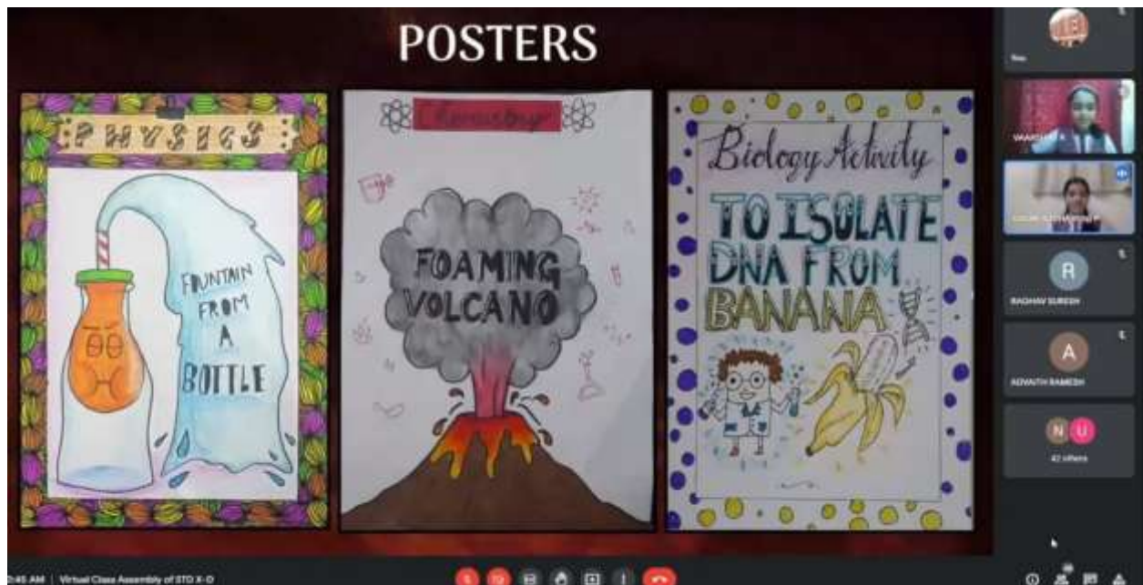
Experiment O Mania - Catchy Posters Displaying Science Activities