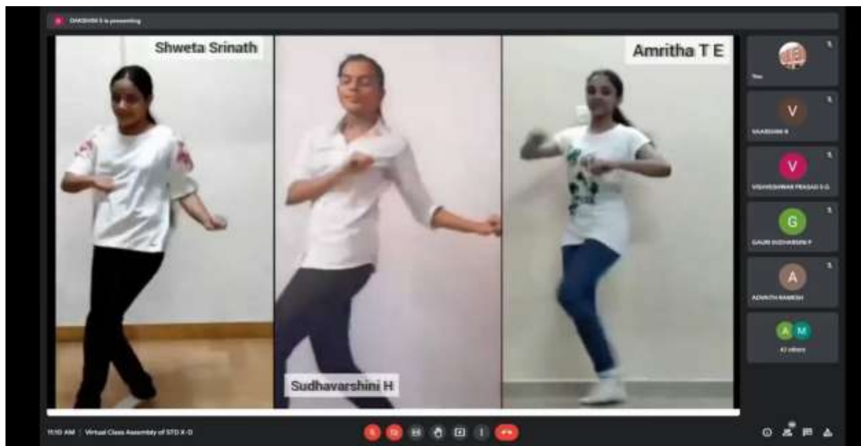
Mesmerising Dance Performance by Passionate Steppers