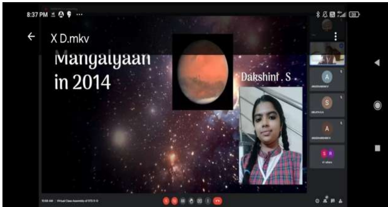
Activity Based Learning- Time Line Activity in Social Science Class