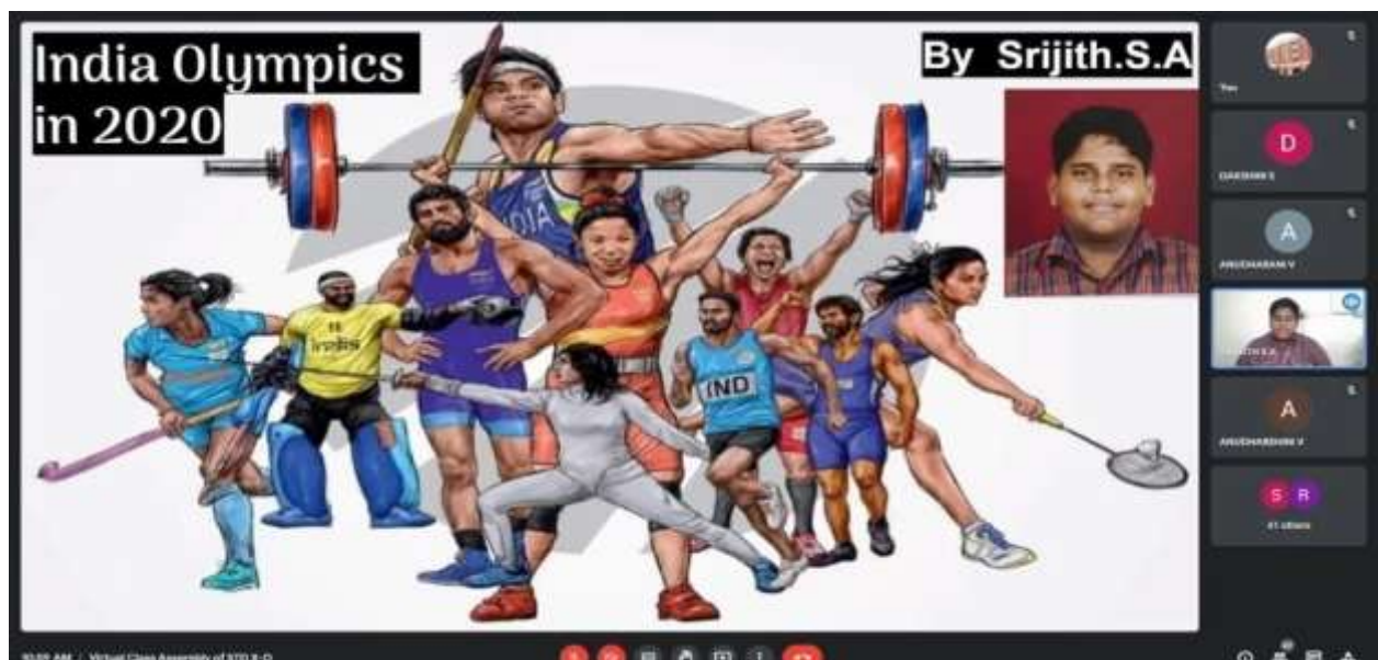
Seize the Proud Moments- Glistening Stars of Olympics 2020