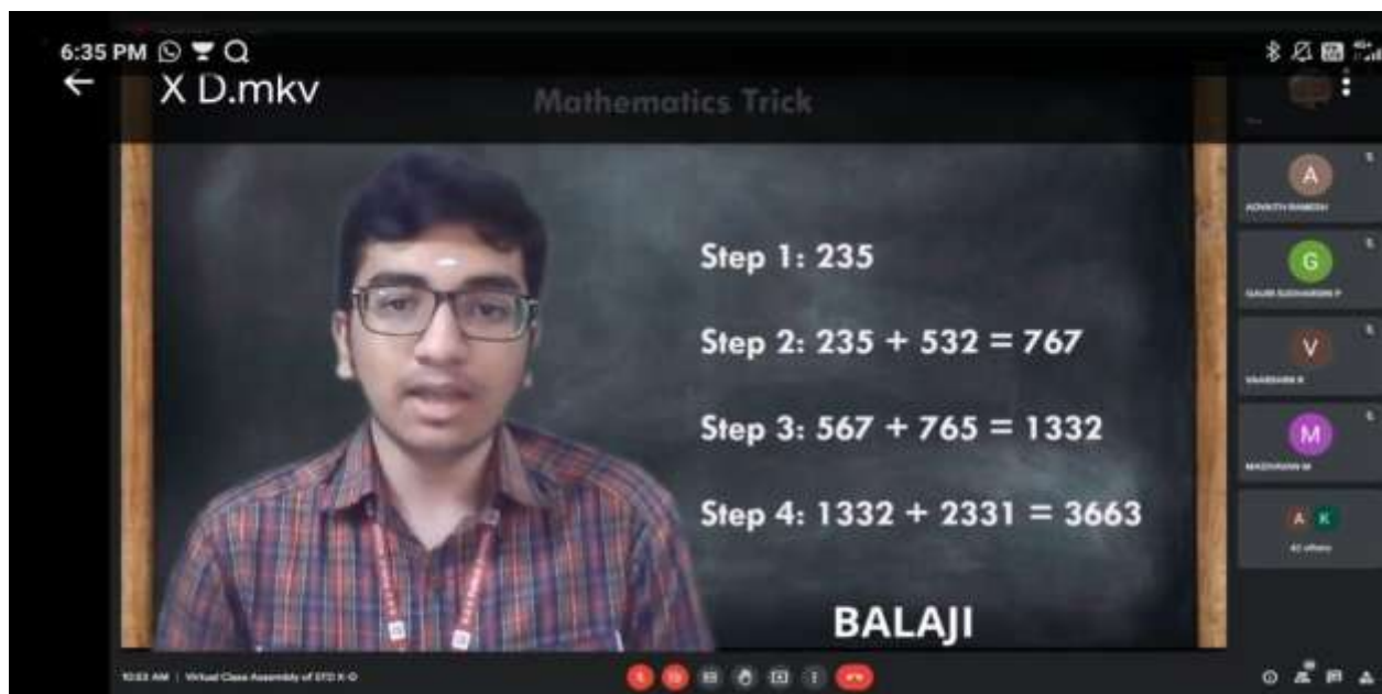
Fun with Numbers- Palindrome Activity-Learning Mathematics with Fun Activities