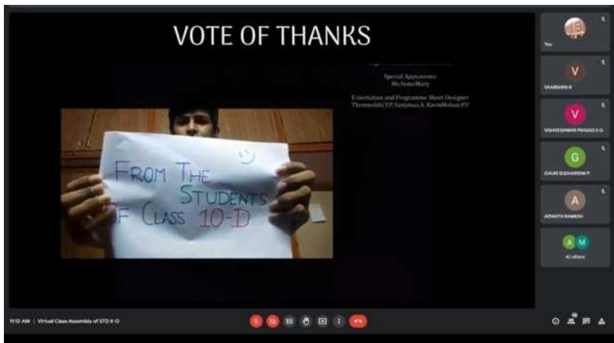
Musical Expression of Gratitude