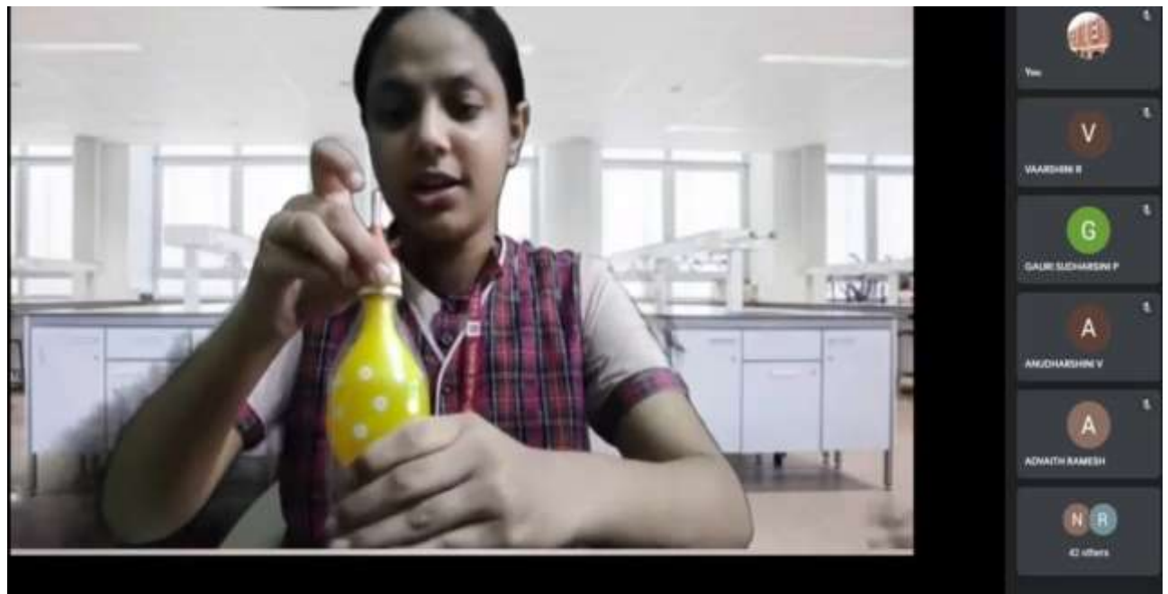
Experiential Learning- - Hands on Learning in Science Lab