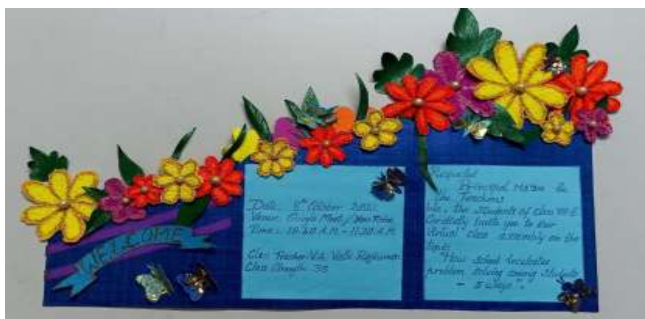
The Creative, hand-made Invitation by Sanchana K