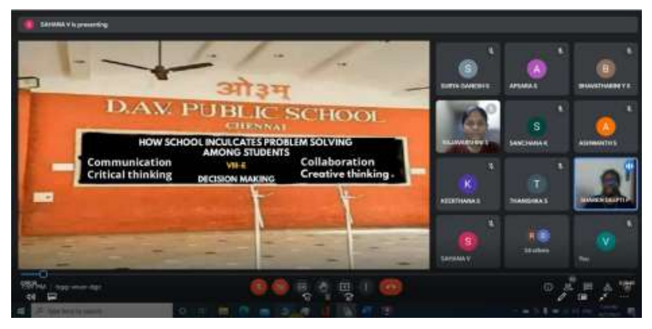
Topic and the Five Ways through which Problem Solving is inculcated in Students