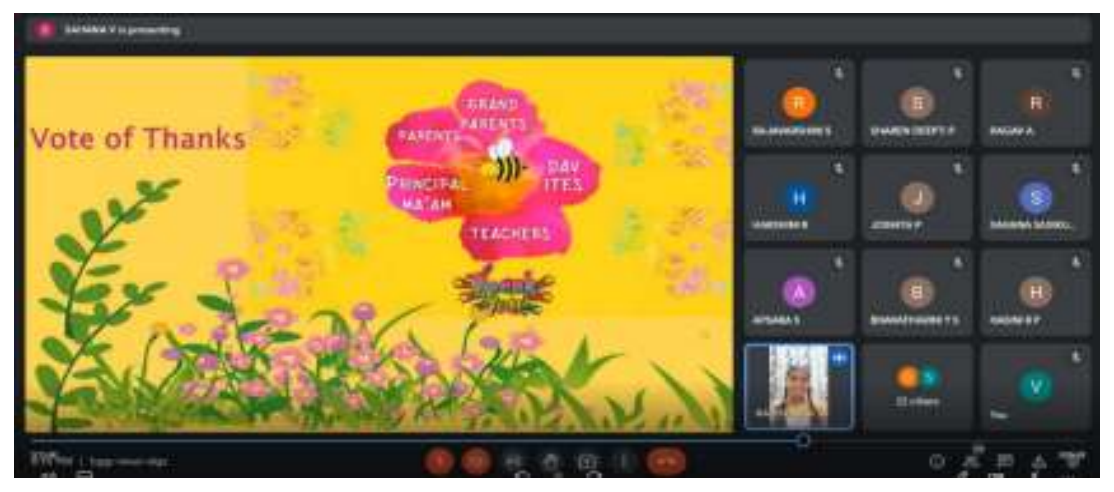
Vote of Thanks – An Animated Video