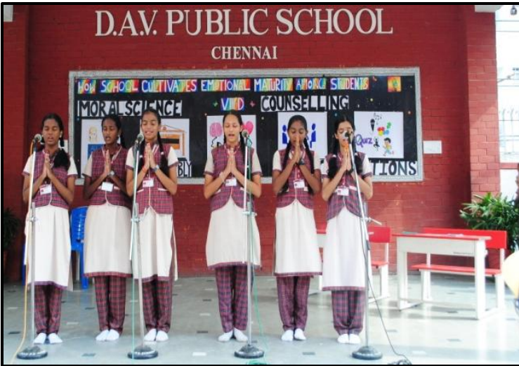
Seeking the divine blessings for a fruitful day