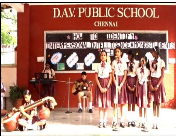
'Song on Empathy' – A Mesmerising Orchestra