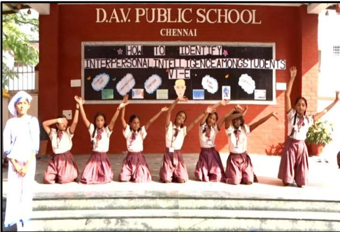
A Dance Tribute to Mother Teresa

TOPIC : HOW TO IDENTIFY INTERPERSONAL INTELLIGENCE AMONG STUDENTS (PEOPLE SMART) – WHAT DID HELEN KELLER AND MOTHER TERESA HAVE IN COMMON? HOW DID THEY UNDERSTAND AND RELATE IT TO OTHERS?