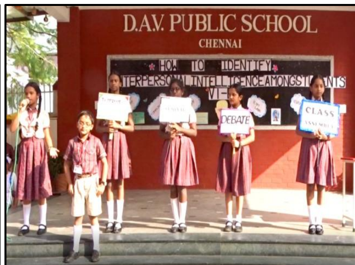
A thought provoking Speech on 'Electronic Gadgets'