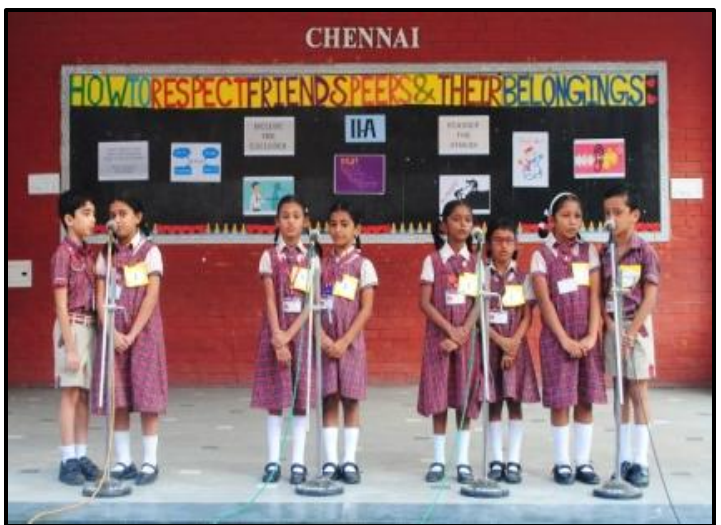
The Nightingales of Std. II Singing on Friendship