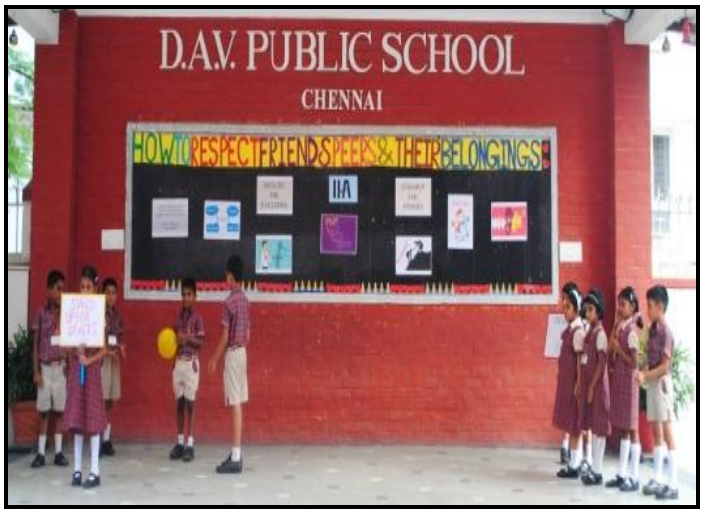
Dumb Charade on 'Taking Responsibility'