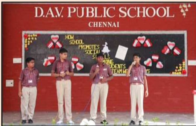
Talk on DAV School and Social skills