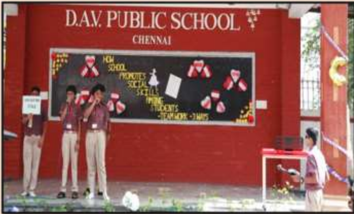
Launching the visually impaired walking stick