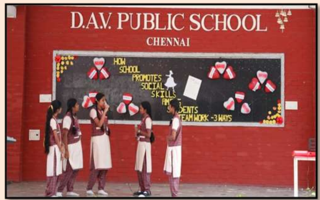
Drama on Social activities