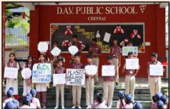
Stage show of various Social Activities