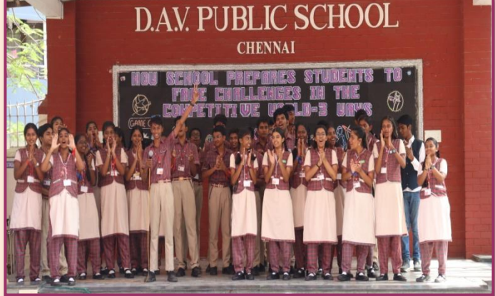
Speech by the Alumnus

Students of Class X D Ready to Face Challenges