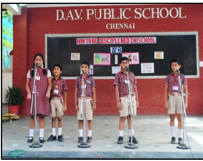
A Speech on 'Discipline - A Way to be Responsible and Safe' 'Quiz Time' - Honing Problem Solving Skills