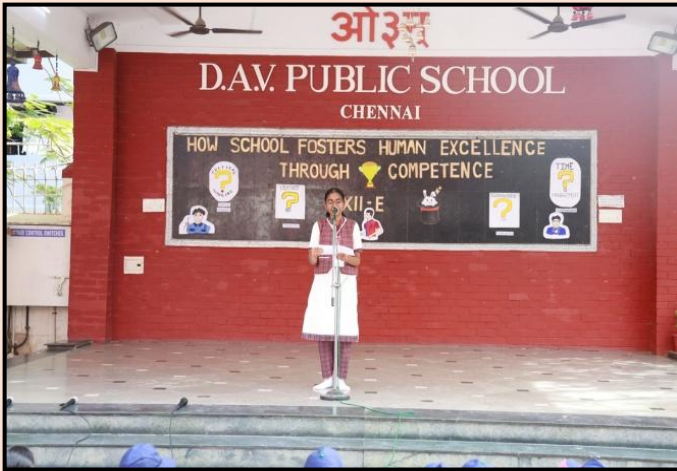
Competence in Our Roots (Sanskrit Slokha on Competence)