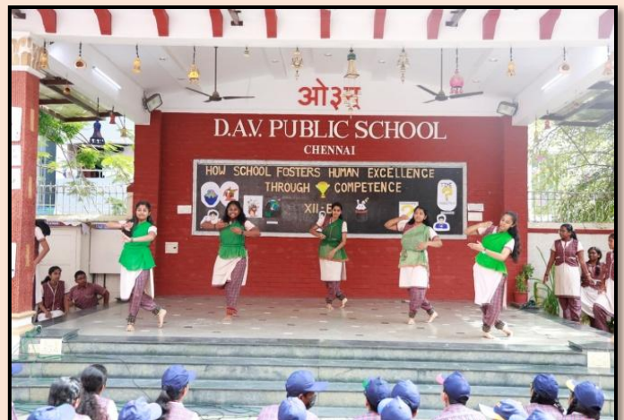
Rhythmic Rampage – Classical Dance