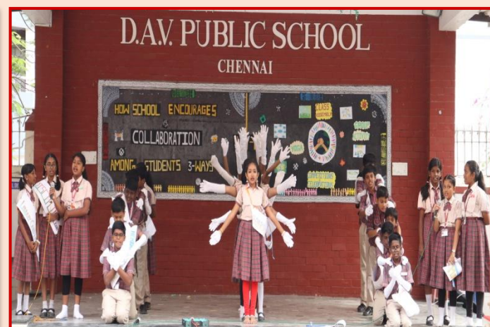
Collaboration in Motion, Harmony in Action