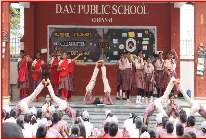
Moving and Creating Together – Fusion Magic