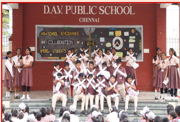
Rhythmic Gems – Tutting Dance