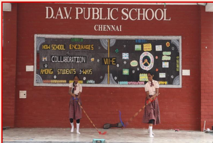
Glimmering and Sizzling Sticks - Silambam