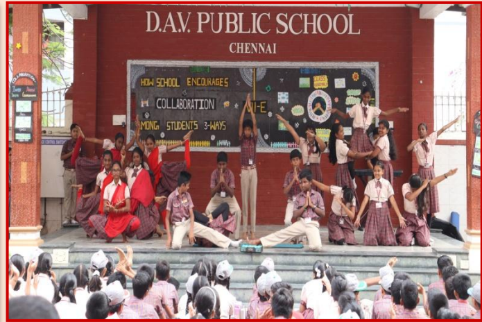
Together We are Unstoppable – Sensational Swifters