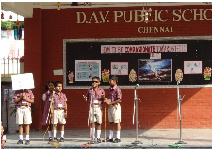
Compassion towards physically challenged – Be Caring