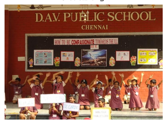
We can, we do, we know