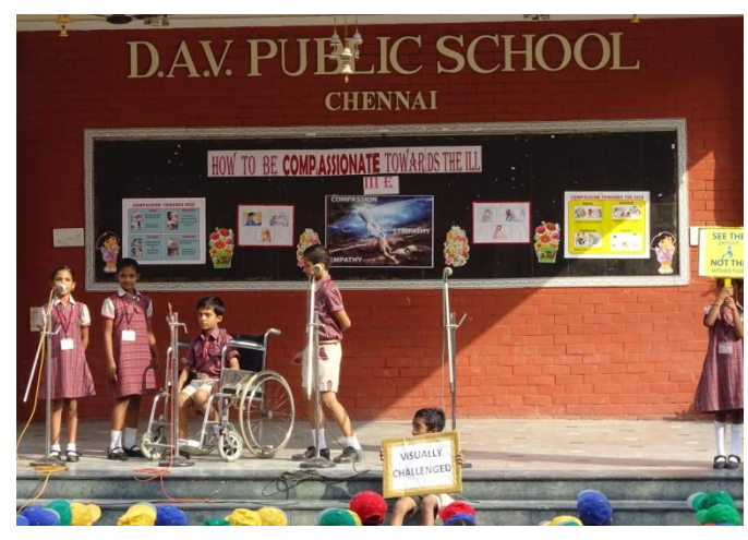
Compassion towards physically challenged - Understanding