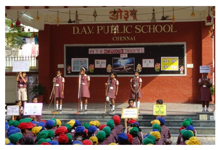
We must develop our Empathy