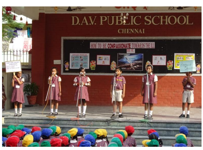
Compassion towards leper person